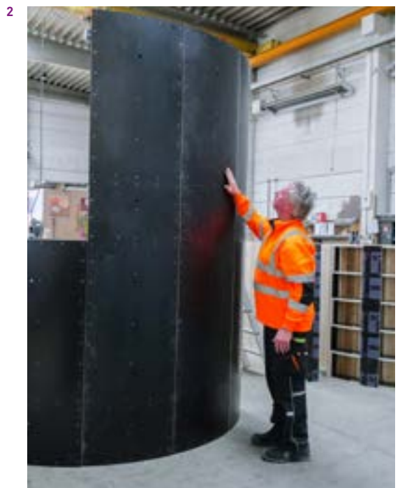
1 Sophisticated shape in the tunnel trough area 2 Our experienced colleagues master any challenge with competence and commitment