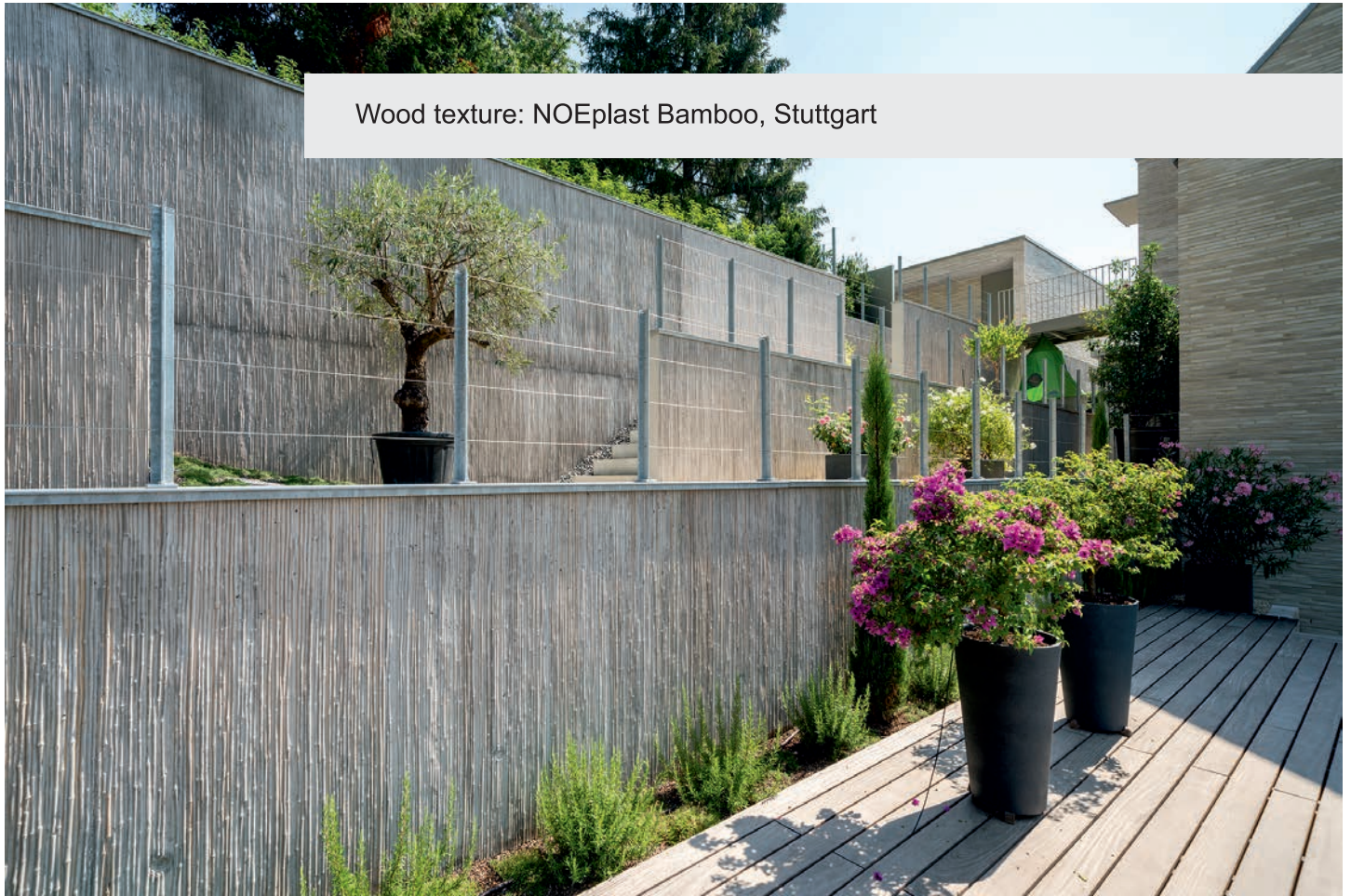
Wood texture: NOEplast Bamboo, Stuttgart