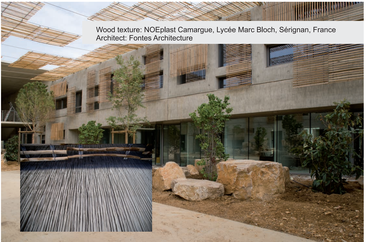
Wood texture: NOEplast Camargue, Lycée Marc Bloch, Sérignan, France Architect: Fontes Architecture