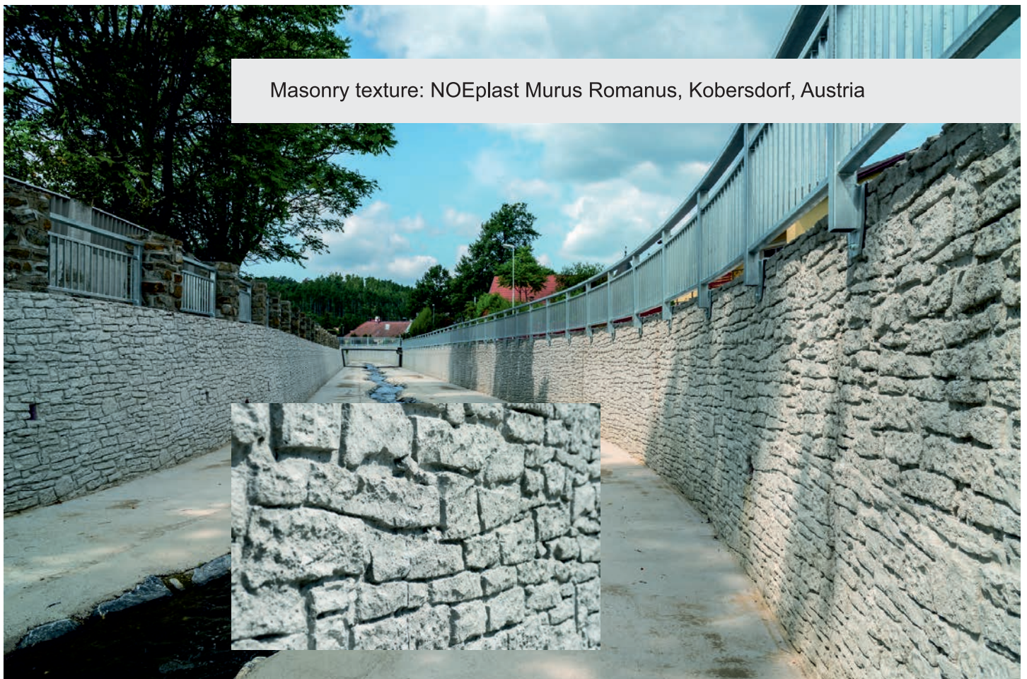
Masonry texture: NOEplast Murus Romanus, Kobersdorf, Austria