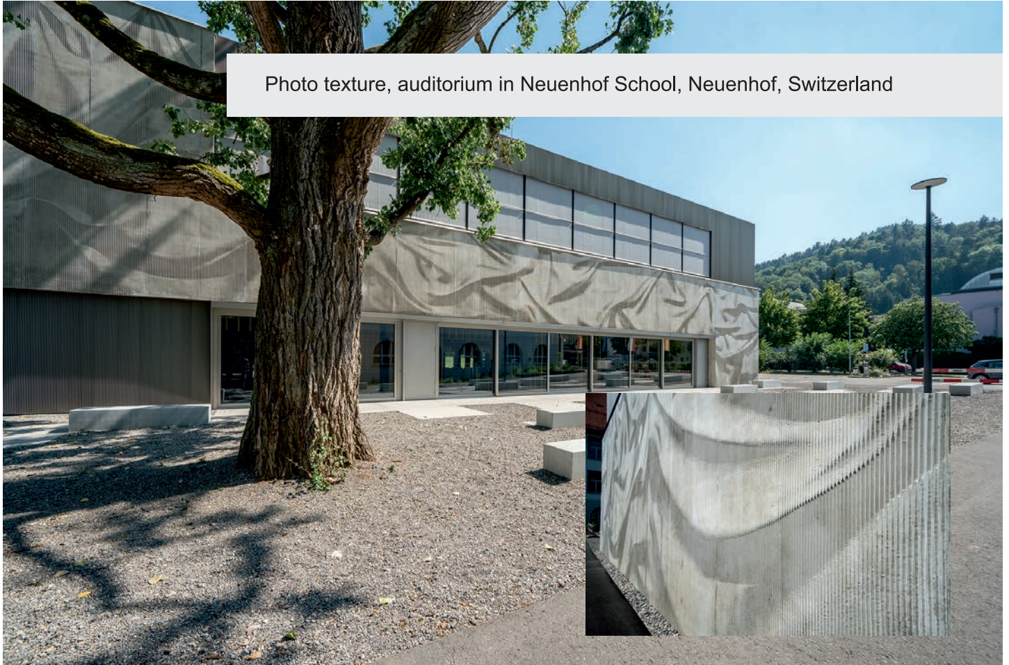
Photo texture, auditorium in Neuenhof School, Neuenhof, Switzerland